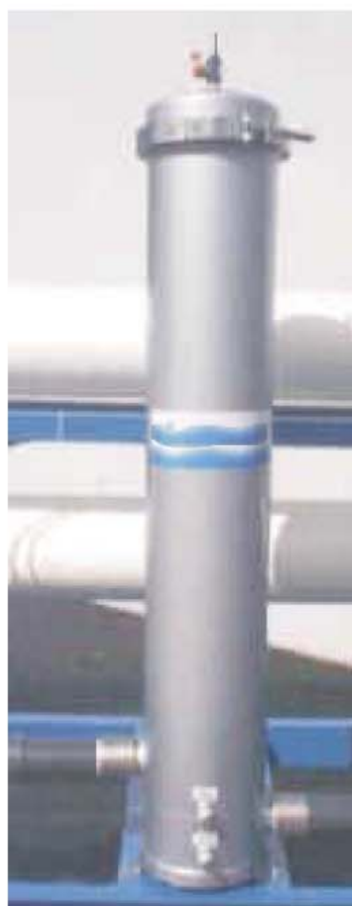
Model: SST-4 to 20