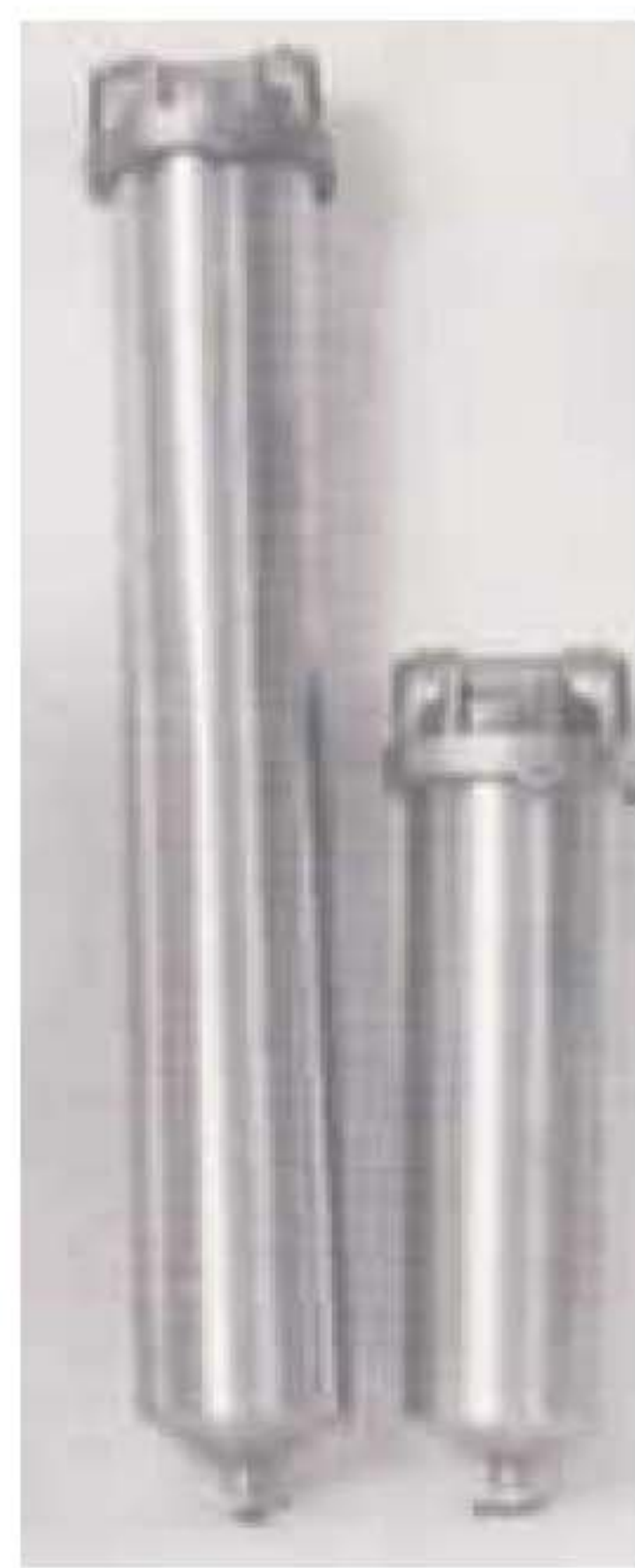
Model: SST-1 to 3